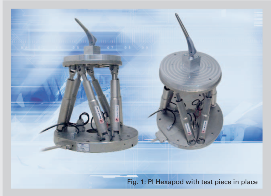
Fig. 1: PI Hexapod with test piece in place

Automatic testing methods in industrial production are an important component of quality assurance, non-destructive testing being the ideal objective. Photothermics is a method which has seen considerable development in recent years. In it, a laser source is used to heat up a spot on a test sample and the propagation of the heat wave is followed with appropriate sensors. By comparing the measured values from the sample with those from a calibration model, the sample can be characterized according to specific criteria. This makes it possible to ascertain layer thicknesses or hardness penetration depths and to detect cracks, pores and damage from local overheating while grinding.